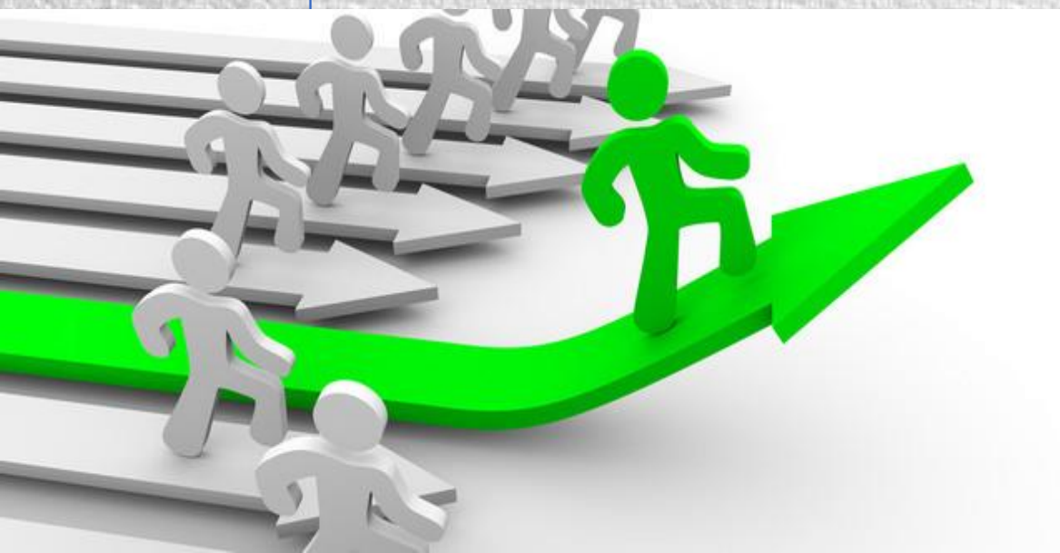
عائدات من التعليم